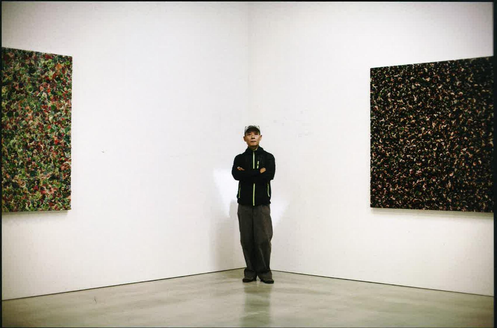
Opposite page: Zhang Huan Poppy Field No. 16 Detail 2013