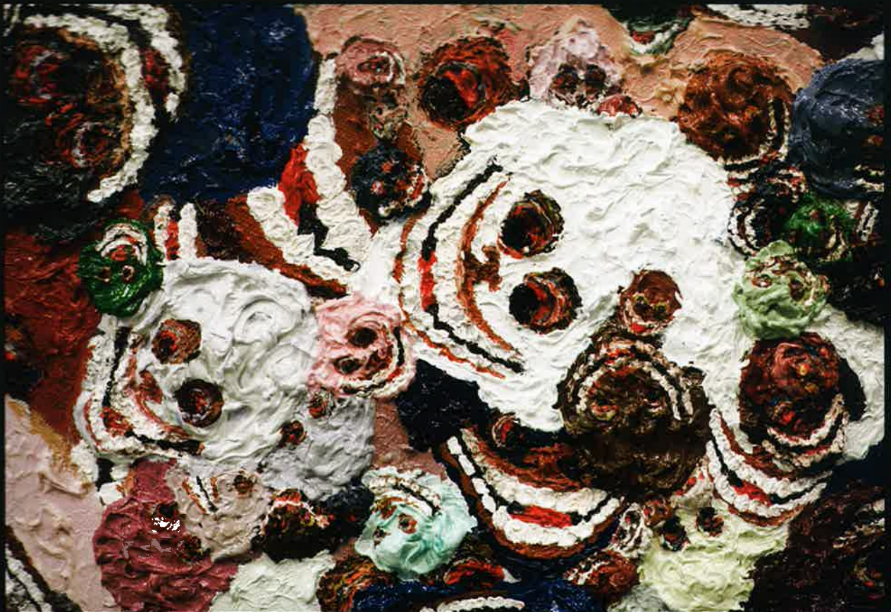
Photo courtesy the artist and Pace Gallery © Zhang Huan Studio, courtesy of Pace Gallery